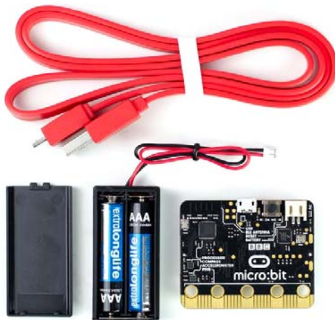
micro:bit Essentials Kit MBIT0003