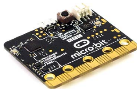
micro:bit only MBIT0004