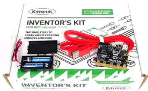
micro:bit Complete Starter Kit