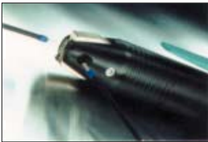
PC 24 - 14 H CLOSE UP VIEW

HAND-CRIMPER TRAPEZOID CRIMPING SIDE AND FRONT INSERTION UNIVERSAL - DIE RANGE 24-14 AWG (0.25-2.50 MM 2 ) LENGTH: 7.9 INCHES (200 MM) WEIGHT: 35.2 OUNCES (1000 G) PRESSURE: 58 PSI (4 BAR)