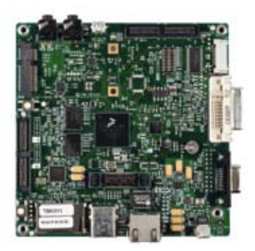
i.MX51 Evaluation Kit