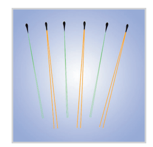
High Precision NTC Thermistor for Extremely Accurate Temperature Measurement