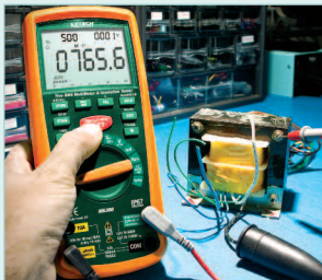
Measure the insulation resistance of transformer windings