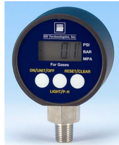
MediaGauge™ Model MGA-9V with rubber boot option