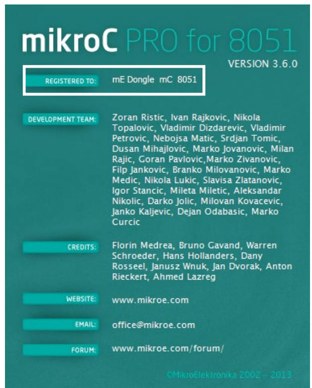
Figure 2: mikroC PRO for 8051 About window