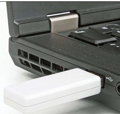
Figure 3: USB Dongle plugged into Laptop USB host connector

Unfortunately not. If you lose your dongle you will need to buy a new compiler license and pay the full price.