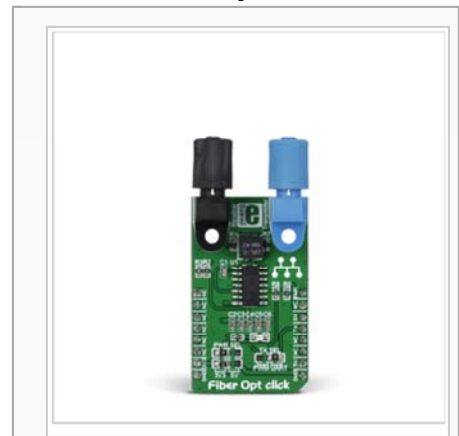
Fiber Opt click