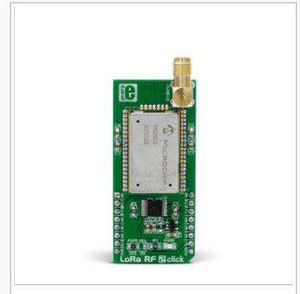
Lora 2 click