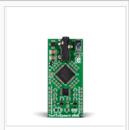
Text To Speech click