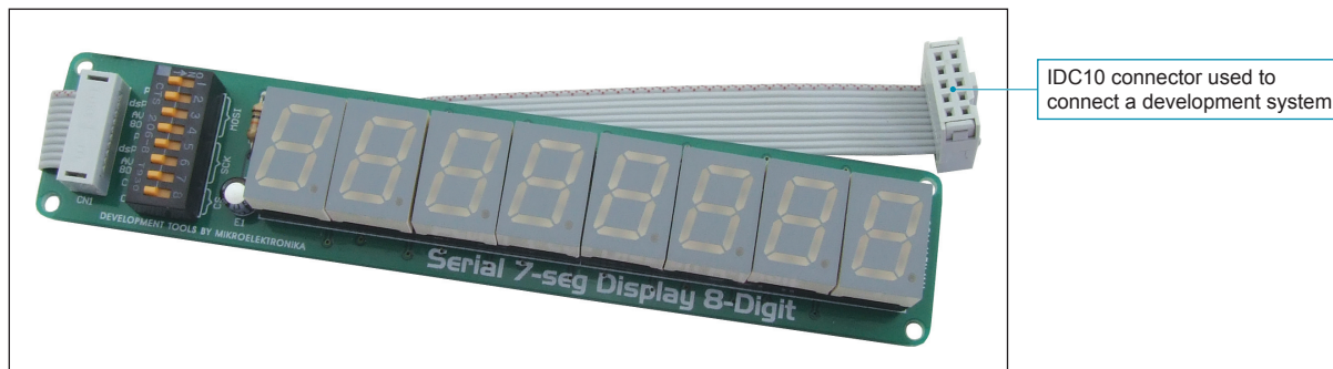
Figure 1: Serial 7-Seg Display 8-Digit additional board

Switches 7 and 8 on the DIP switch SW1 can also be used for connecting the CS pin (Chip Select) on the additional board to a development system. Depending on the development system in use, CS lines will be connected to different I/O port pins. Accordingly, it is necessary to define in the program, to be loaded into the microcontroller, which pins will be used as the CS pin (Chip Select).