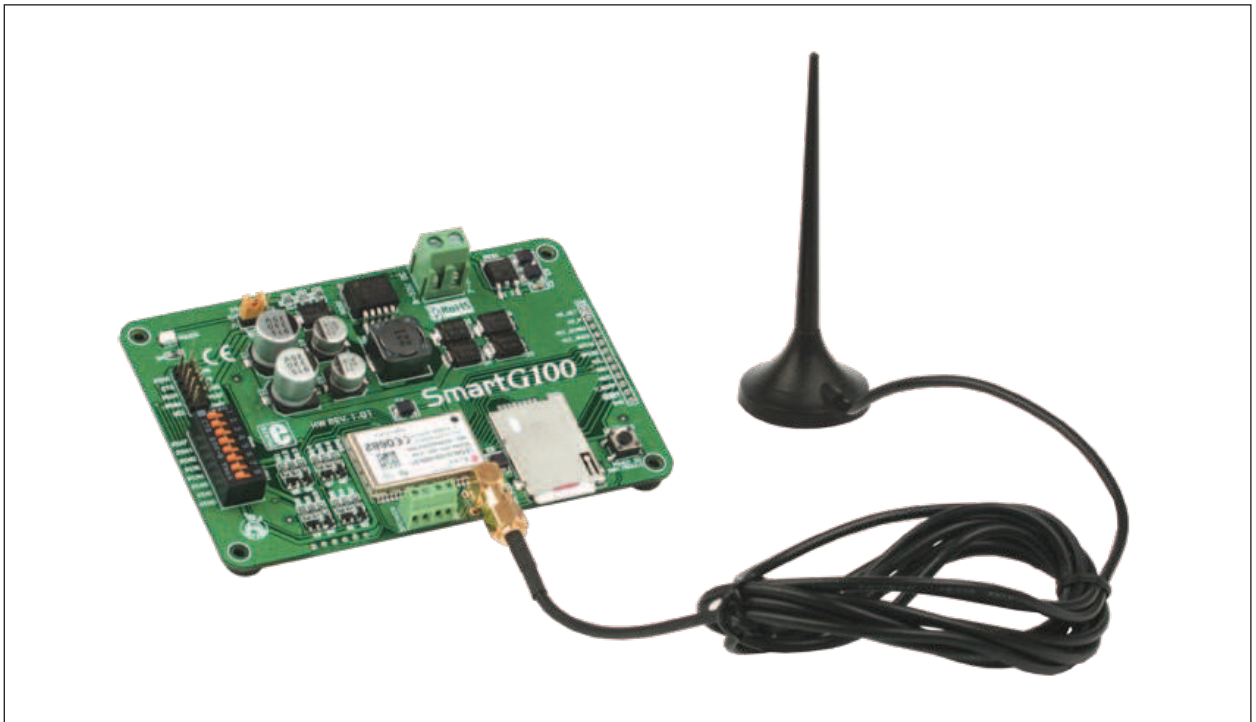
Figure 1: SmartG100 with uBlox Leon-G100 module