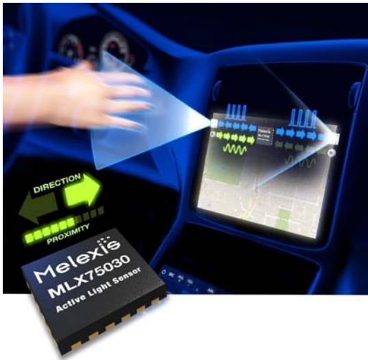
Figure 2: The Melexis MLX75030

The MLX75030 allows external switches to drive the LEDs up to a peak current of 1 A, while the MLX75031 has LED driver functionality built in, in order to minimise the additional components needed and thereby lower the bill of materials. Internal control logic, configurable user registers and a SPI interface enable simple, fully programmable operation. A 16-bit ADC incorporated into each of these ICs allows creation of a digital output. The digital data on the measured active light and ambient light levels is passed to the system microcontroller, where it can be processed (a measurement rate of up to 700 Hz per measurement channel allows smooth interface response times). Then, via software algorithms on an external microcontroller, the system can distinguish between different gestures (e.g. left/right/up/down swipes and circular movements). As ambient light has already been factored out by the interface IC, the microcontroller's processing resources can be focussed on its other responsibilities.