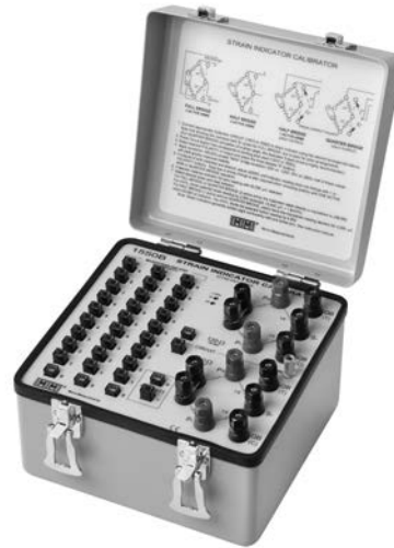
A laboratory standard for verifying the calibration of strain and transducer indicators.