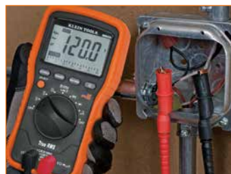
Alligator Clips Attach to Bare Wire