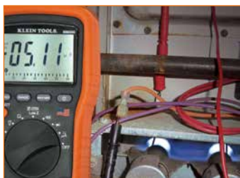
Measure Flame Sensors