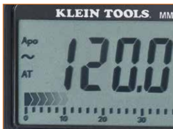
Analog Bar Graph