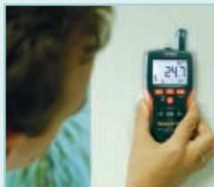
Measure moisture of wall material with non-invasive Pinless technology