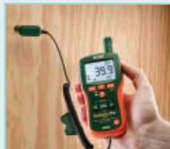
Pin Moisture Probe included for making contact moisture measurements