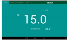
HUMIDITY / TEMPERATURE