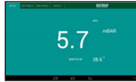
mBAR / TEMPERATURE