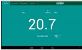
MOISTURE / TEMPERATURE