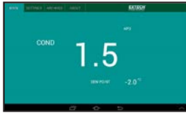
CONDENSATION / DEW POINT