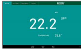
GPP / TEMPERATURE