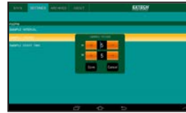
EASY TO NAVIGATE MENUS