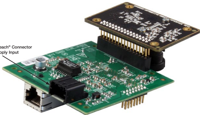
Figure 2: Qorivva MPC5604E Kit (bottom angle)

J3 - BroadR-Reach® Connector with Power Supply Input