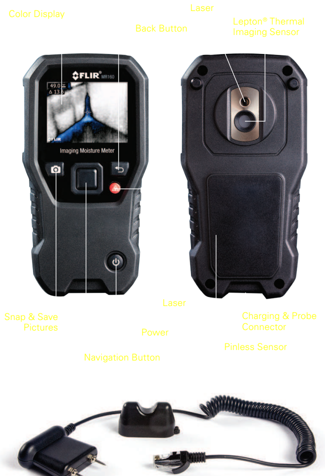
MR02 Pin Probe included

PORTLAND Corporate Headquarters FLIR Systems, Inc. 27700 SW Parkway Ave. Wilsonville, OR 97070 USA PH: +1 503.498.3547