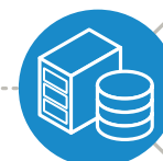
Asset Management Platform