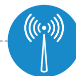
Wireless Service Provider