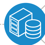
Asset Management Platform