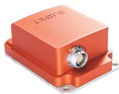
MTi encased: 57x42x23.5 mm, 52g, 9-pins push-pull connector