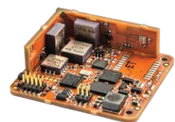
MTi OEM: 37x33x12 mm, 11g, 16-pins header