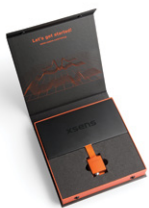
MTi 10-series Development Kit: MTi, software and cabling