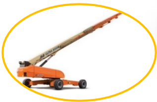
Aerial Lift Safety