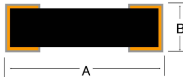
TABLE I. DIMENSIONS: