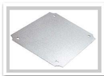
Click on Image for Larger View