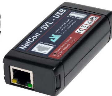
Front with PowerOverEthernet