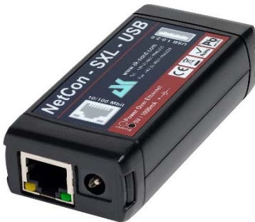
Front with power supply connector