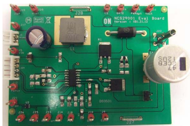
Figure 1. Evaluation Board (not to scale)

This evaluation board can be used to evaluate the device performance and it allows the user to place the NCS29001 device in a real application environment. While the intention is to evaluate the device according to datasheet specifications, it is important to take into account the additional circuitry inherent to the setup which can affect performance.