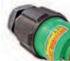
Order suffix = HG

Ordering information – see page M-2 for full details of the options available