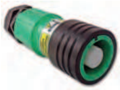
Order suffix = SC

Rubber hand grips are available that fit over the ribbed section of the main insulator body, these grips assist with the handling of the connectors when being used in difficult conditions.