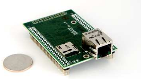
Figure 1: MOD54415