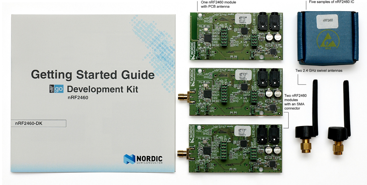
Figure 1. Kit content

The nRFgo compatible nRF2460 Development Kit contains the hardware, software and documentation components outlined in sections 2.2 and 2.3 .