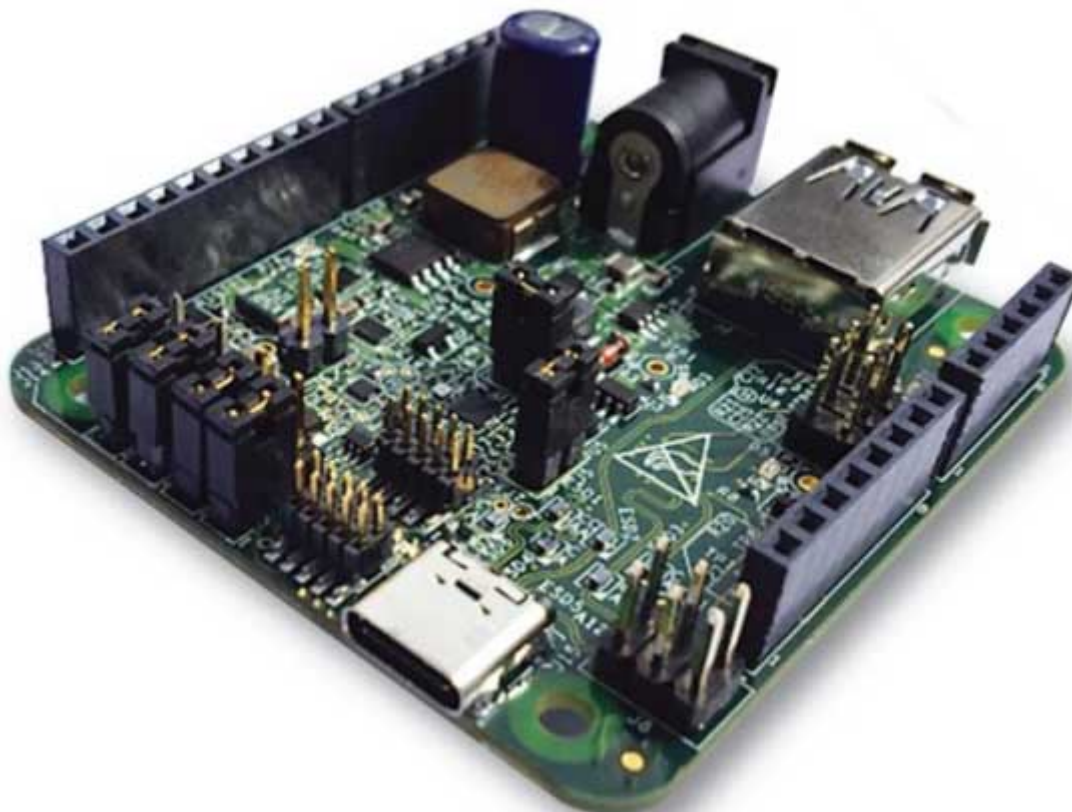
Figure 2. USB PD shield board