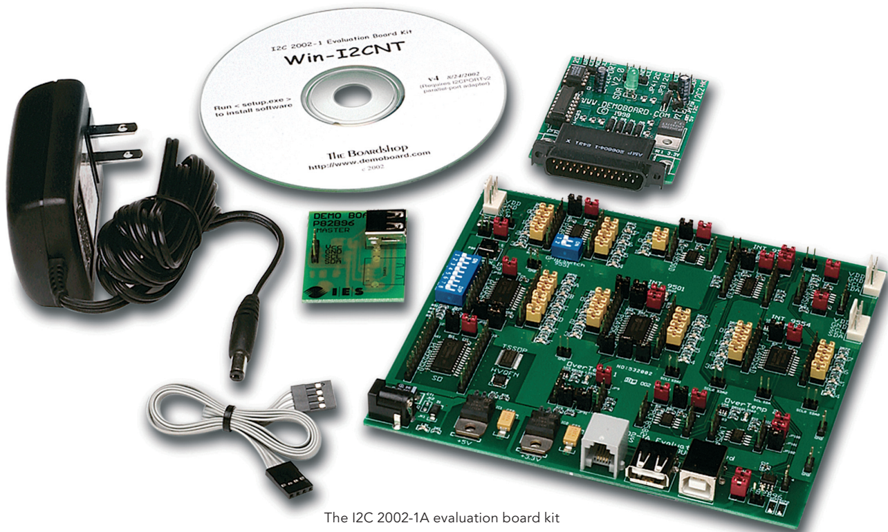
The I2C 2002-1A evaluation board kit

Purchase either board at www.digikey.com or www.demoboard.com .