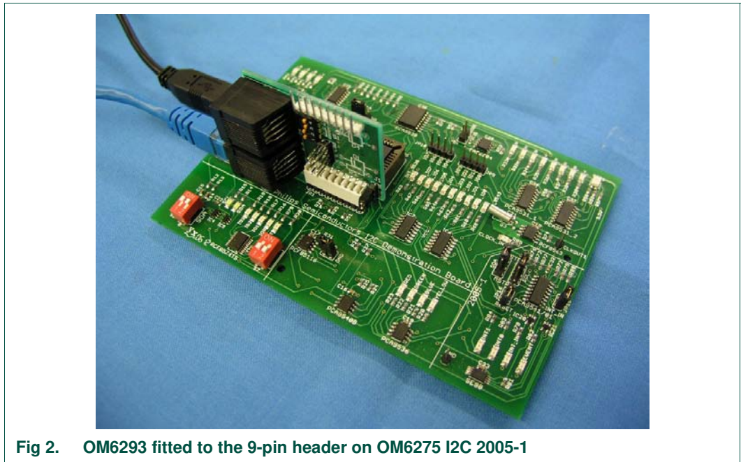
Fig 2. OM6293 fitted to the 9-pin header on OM6275 I2C 2005-1