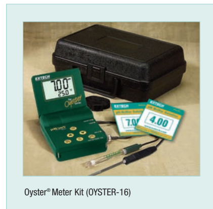
Oyster® Meter Kit (OYSTER-16)