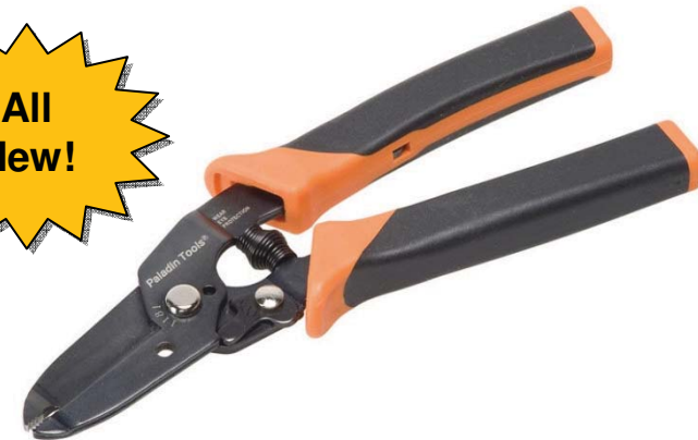
PA1181 Flat Cable Cutter Professional cutting tool for electronic and computer applications.

Cut flat satin cables easily and quickly Gripping pliers at tip of the tool ProGrips for improved comfort and control