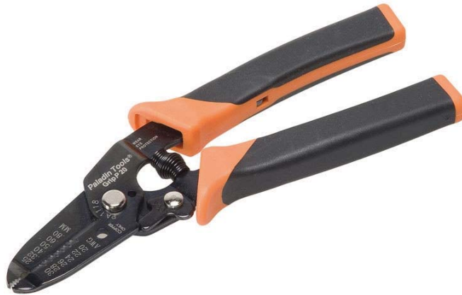
PA1117 Wire Stripper 22-10 AWG* PA1118 Wire Stripper 30-20 AWG * PA1123 Wire Stripper Bundle *

Upgraded existing products with dual-material ProGrips for improved comfort and control