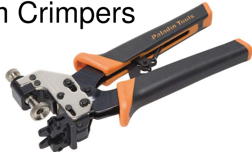
PA1559 – SealTite ProM Coax Crimper

Professional, fully ratcheting coax compression crimper for standard and “mini” CATV-F, RCA and BNC connectors for RG59, RG6, RG6Q and RG58 cables. Also accommodates right-angle connectors. Dual-material grips for improved comfort and control.