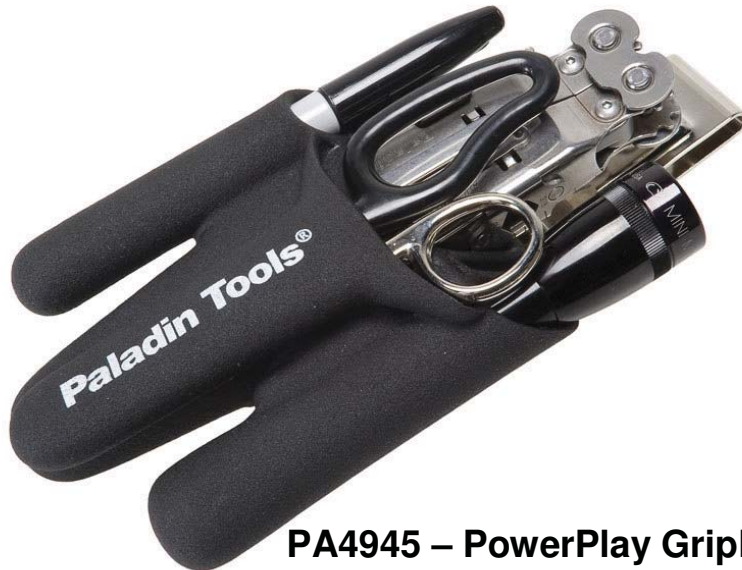
PA4945 – PowerPlay GripPack*

Same features as other GripPacks; securely holds tools in place, swiveling quick release belt clip. This version holds PT-540 in open or closed position. Includes: