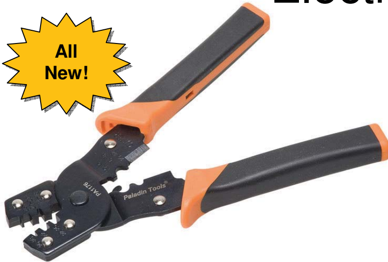
PA1176 – Electrical Terminal Crimper