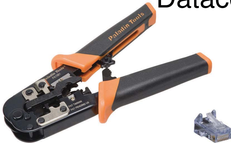
PA1561 – All-in-One UTP Snagless Crimper

Professional, fully ratcheting UTP crimper for standard and ‘snagless” RJ45 connectors. Also crimps RJ11/22 and RJ 22 WE/SS style plugs.