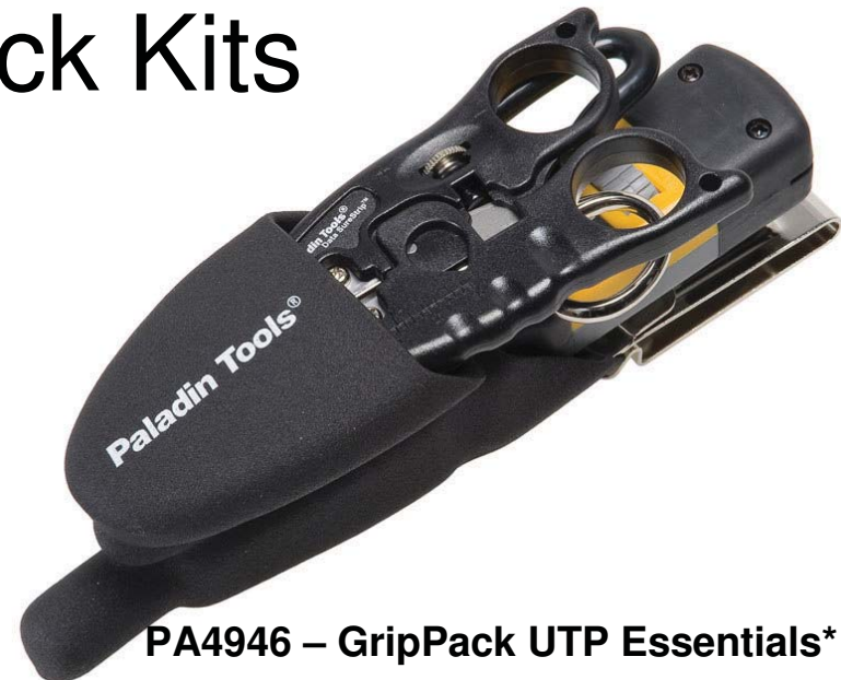
PA4946 – GripPack UTP Essentials*

Same features as other GripPacks; securely holds tools in place, swiveling quick release belt clip..