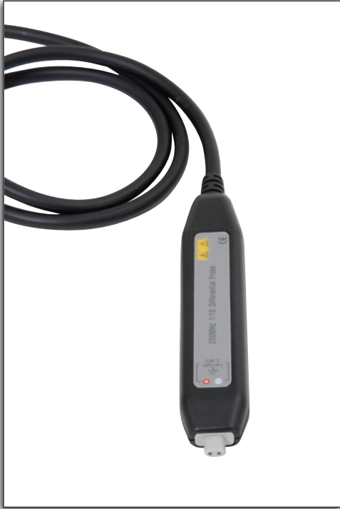
The ZD200 provides 2 closely spaced differential inputs to connect directly to header pins, or connect probe tips or leads.