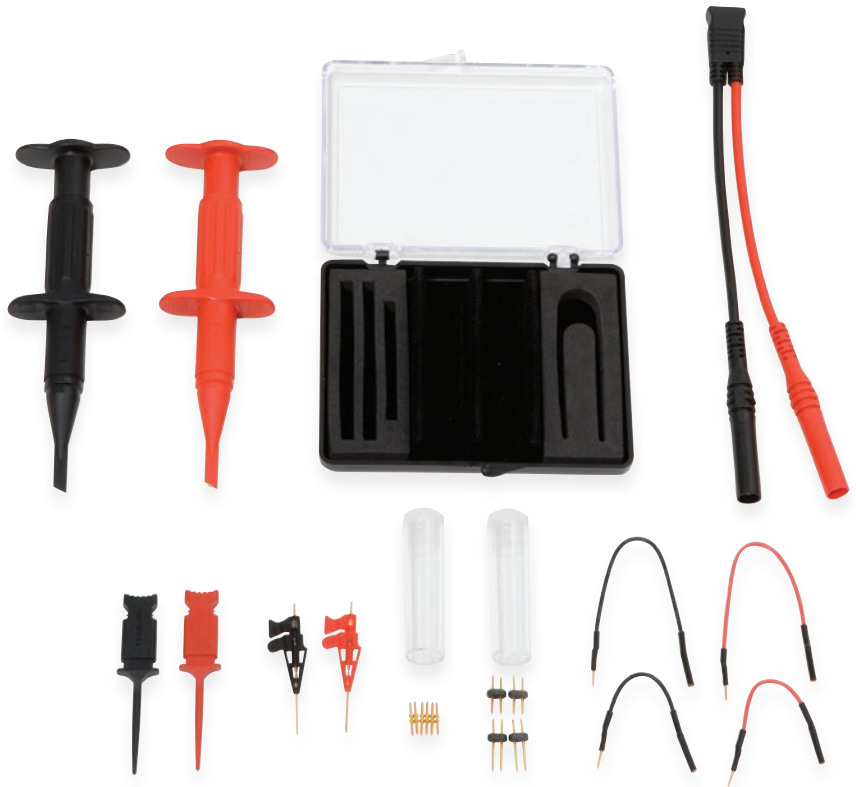
The ZD200 Accessory kit includes an assortment of leads, clips, and straight tips.