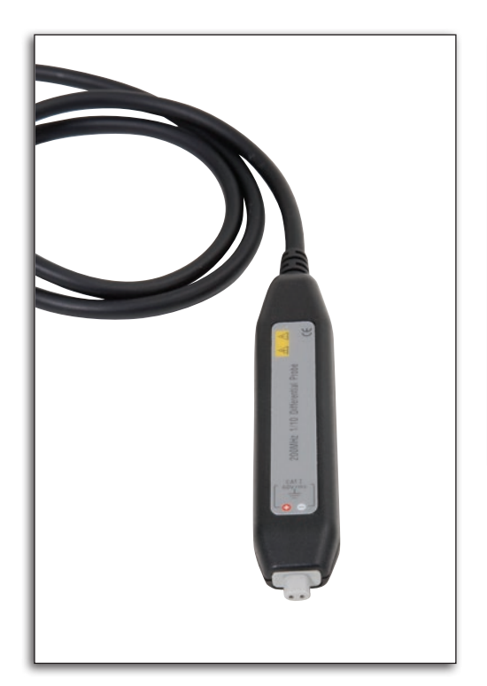
The ZD200 provides 2 closely spaced differential inputs to connect directly to header pins, or connect probe tips or leads.