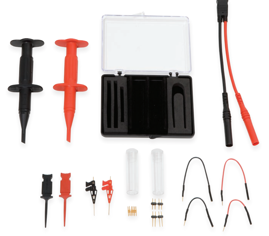
The ZD200 Accessory kit includes an assortment of leads, clips, and straight tips.