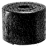
φ 24.0 × H18.0