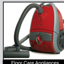
Floor Care Appliances