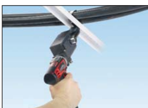
360° Rotating Head