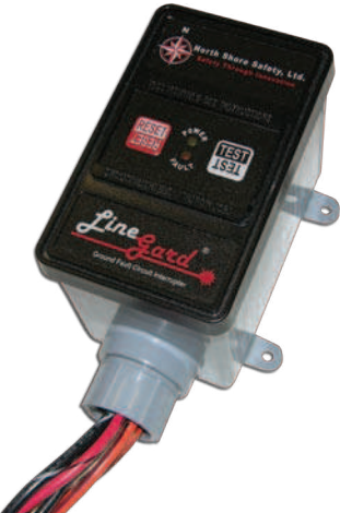
Flying Leads (Splice-in)