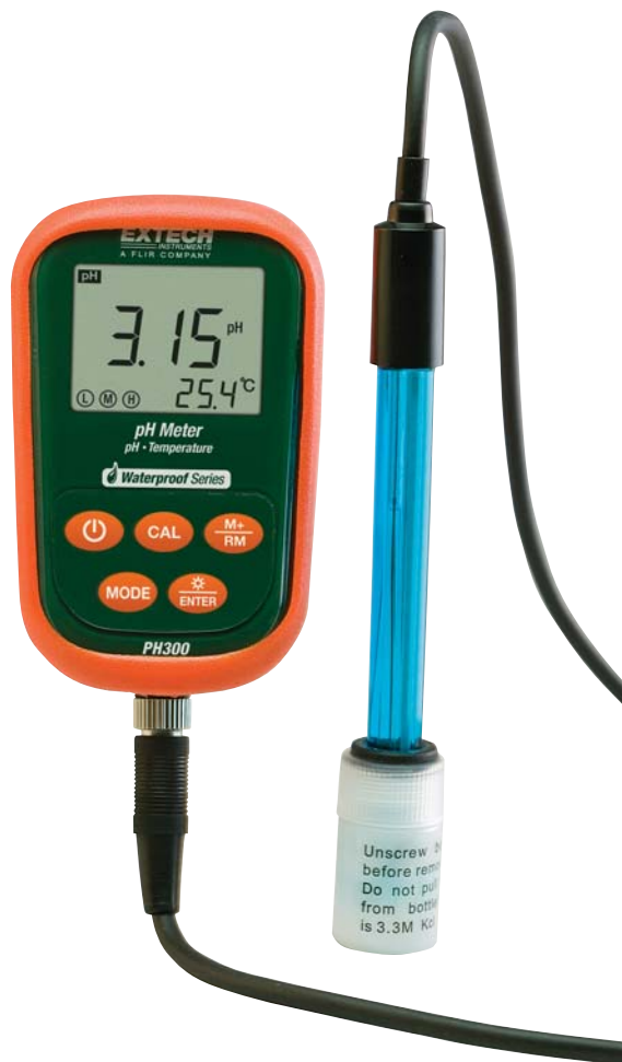
Large blue backlit dual LCD display with calibration and memory indicators