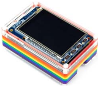
PiTFT Plus layers PIM092