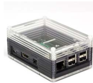
Height extension PIM060