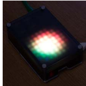
Ninja diffuser PIM064