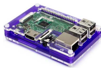
Coupé Royale PIM163