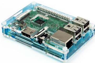
Coupé Flotilla PIM164