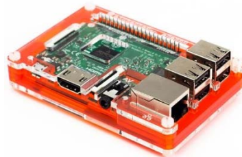
Coupé Tangerine PIM165