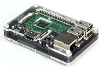
Coupé Ninja PIM149