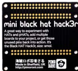
PCB only PIM171