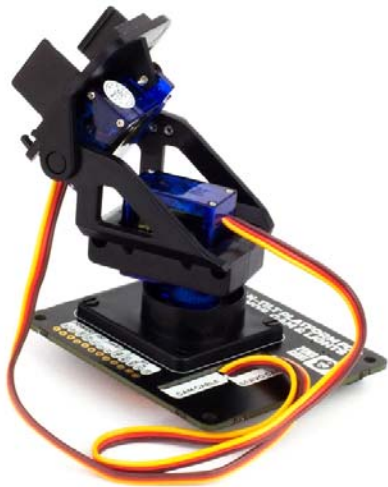
Full kit PIM183