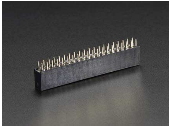
Female SKU: PIS-0243