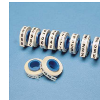
PMDR - * - *