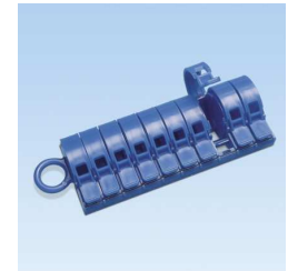
PMD EMPTY DISPENSER