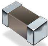
CS160808-68NK Multilayer Chip Inductor