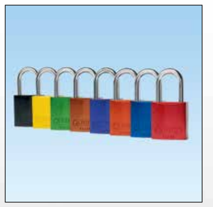
Compact Aluminum Padlocks