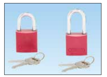
PSL-7 and PSL-7-LS